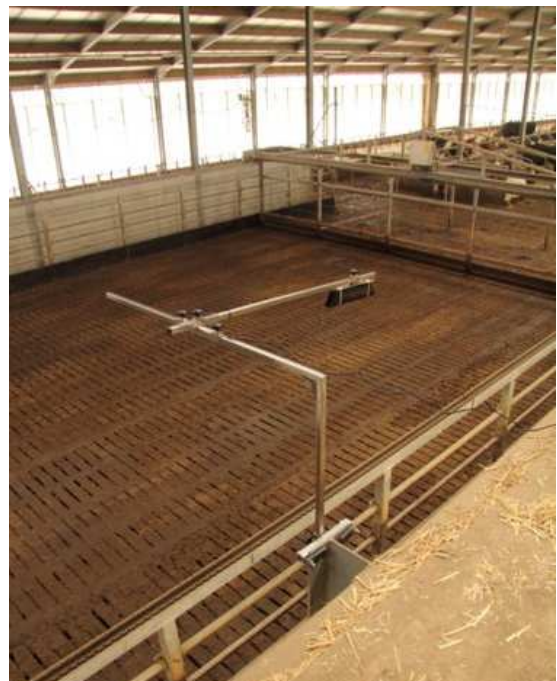
Photo 2: Set up of the automatic 3D image-based system developed by KU Leuven.

An automatic method to assess lameness without assessor opinions would be able to eliminate this subjectivity. An automatic 3D image-based system for detection, based on the posture of the cow's back has been tested by our colleagues in Leuven, but there remains variability between individual cows and a correct identification rate of 76%, which does leave nearly a quarter of lame cows undetected. This system is still under development and is not commercially available yet.