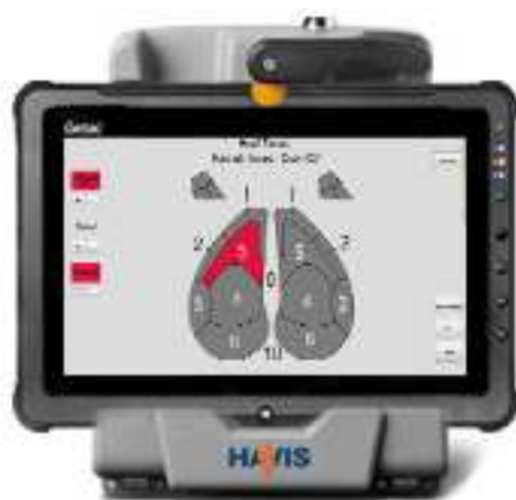
Photo 7: Rubber mounted tablet with software to record hoof problems and treatments (Supervisor System™)

Professional trimmers in the UK have been using specialized software to record disease as they trim. This software can either be installed on a local computer, or on robust rubber mounted tablets that can withstand the harsh environment of the dairy farm. When trimmers are taking care of a cow, they can indicate in the software what the problem is, where it is located and which treatment they will apply. This information is then available for reference next time the trimmer trims the cow, but can also be used for herd-level analyses. For example, if an excessive amount of trouble occurs on the same claw of the same hoof for different cows, this can imply that there is a problem regarding turning somewhere in the unit.