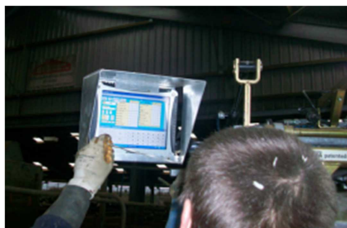
Photo 8: Hoof care recording system installed on a local computer (Hooftec)